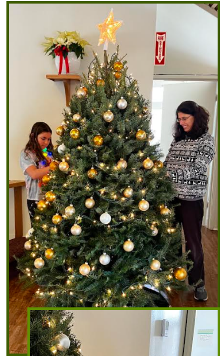
Setting up for Christmas - Thank you all!